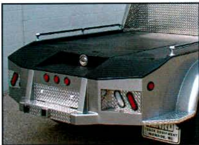
Trough Cover to Provide Flat Floor