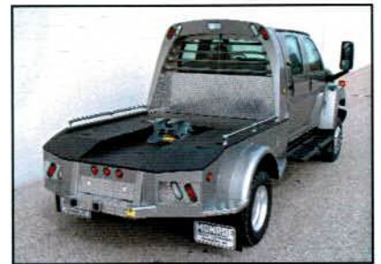
B&W 5 th Wheel Hitch