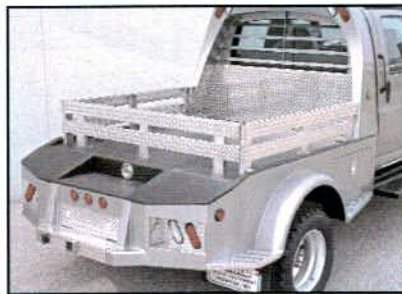
Stainless Steel Treadplate Stake Racks & Trough Cover